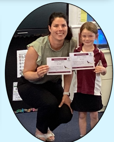
Assembly award recipients and KP1 item