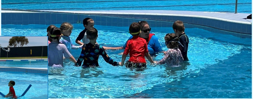
Kindergarten and pre primary students enjoying their swimming lessons.