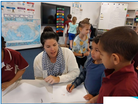
Whole school activities about kindness and being a good friend